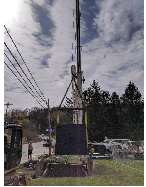
Rig-All setting the Chamber.