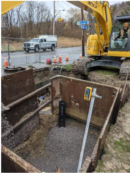
Excavation at Pond Lane & Albany Street.

The first pre-engineered, factory tested and fully operable PRV Chamber to be utilized by the MVWA. This new chamber was installed to replace a very small manhole type chamber with inoperable valves. The work was accomplished in several days as opposed to several weeks if constructed on site. The station was in service one day after final connections were made.