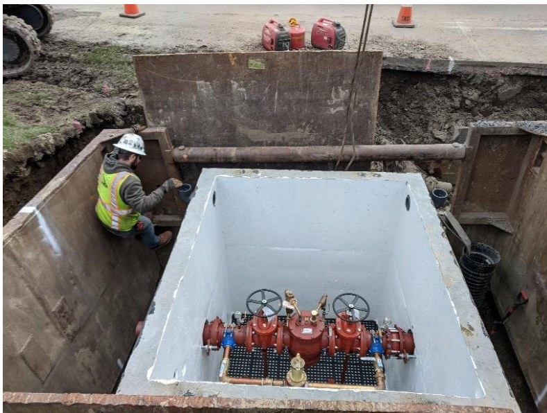
New 6" & 2" PRV and Isolating Valves.