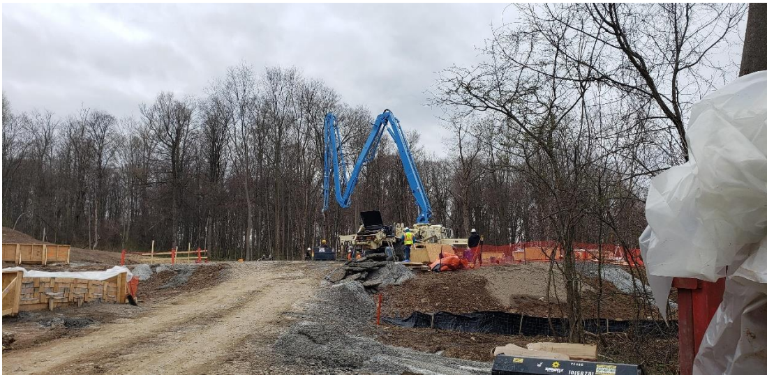
Concrete Placement for Foundations and Floor.

The new 1.2 million-gallon Snowden Hill Road Water Storage Tank will increase water storage and stabilize pressures for South Utica, New Hartford and the Frankfort High Service Zone areas.