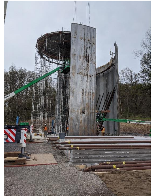
Erecting Precast Concrete & Steel Panels. Panel has overflow outlet installed.