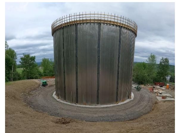
Placing Safety Railing for Roof Panel Placement.