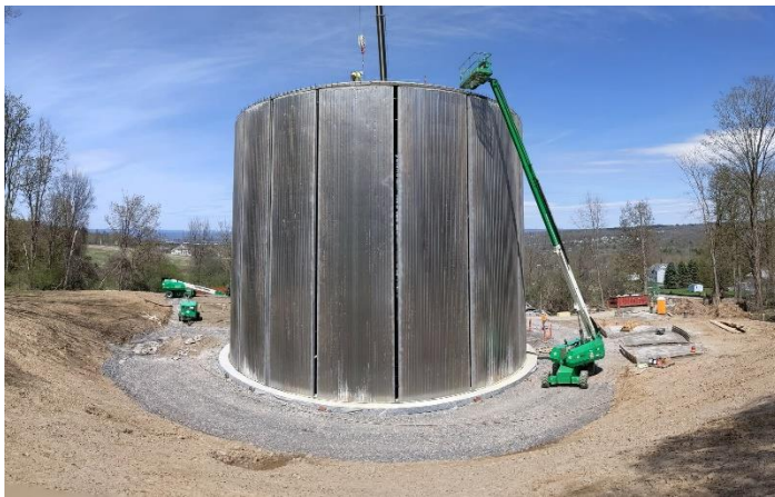
Pumping Concrete into Interior & Exterior Panel Joints.